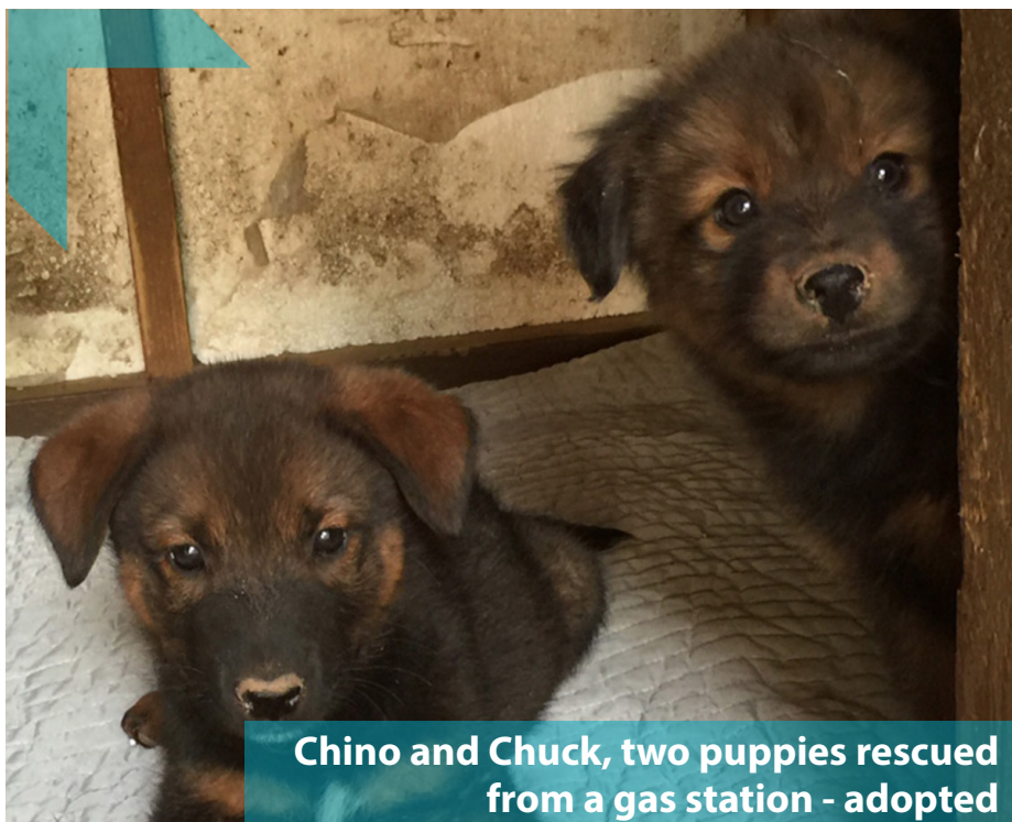
Chino and Chuck, two puppies rescued from a gas station - adopted

for and receive three grant awards. One grant from the Arizona Community Foundation has helped to partially pay for some of the cost of veterinary care for rescued animals. Veterinary costs are high because many of the animals we rescue are sick. Mange, parvo, and tick disease are common. We still need to raise more funds for veterinary costs, which are 98% of our costs. Other grants from the Tuba City Community Fund and Arizona Pet Friendly License Plates allow us to offer a subsidized low-cost spay/neuter program for the public. We currently have only a handful of foster homes. We need more foster homes, and people who can help us transport animals from Tuba City to Flagstaff and the Phoenix area. We really need more help, of all kinds.