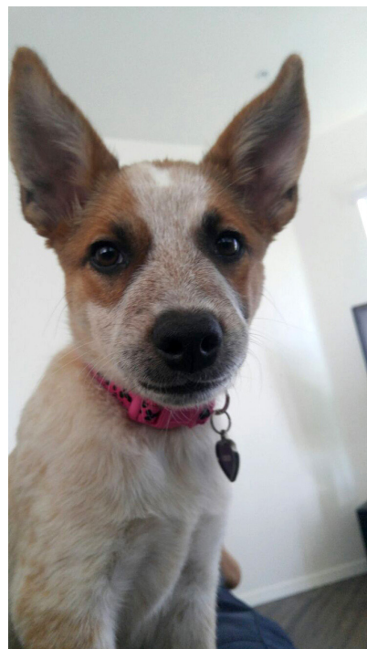
Coco, parvo survivor - adopted