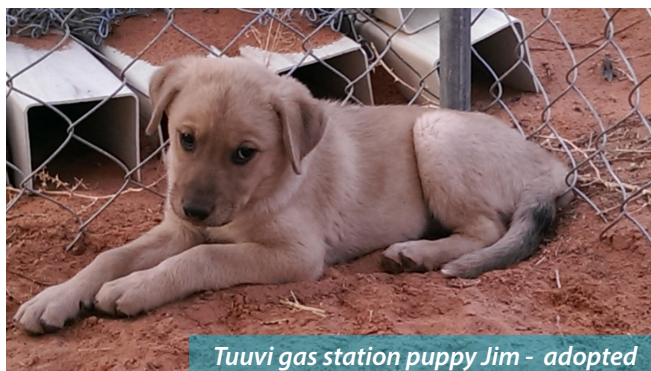
Tuuvu gas station puppy Jim - adopted

In this year of change, we seek a sustainable way forward. The need is great, and we are helping more animals than ever. If you have ideas of how we can support our work, and continue to rescue, please share them with us. We could not have succeeded and cannot continue to succeed without your support.